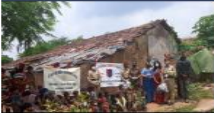
Unnamed Road, Kalpani, Madhya Pradesh 462042, India