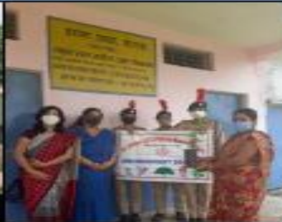
Unnamed Road, Kalpani, Madhya Pradesh 462042, India