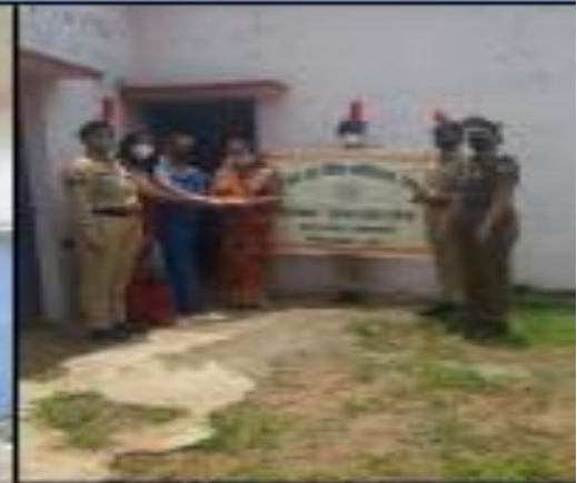
Unnamed Road, Kalpani, Madhya Pradesh 462042, India